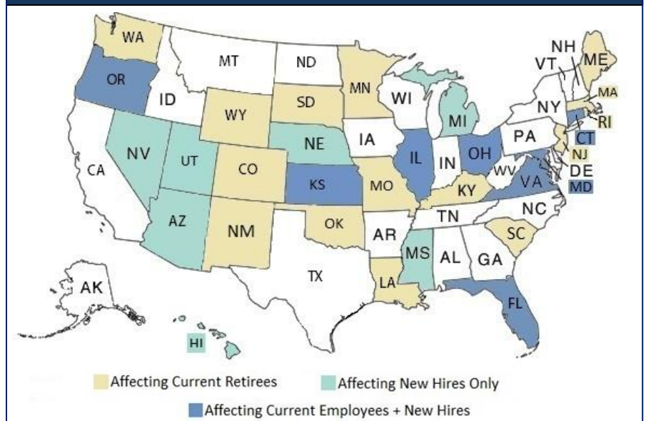
Figure 2: State Retirement Systems Undergoing COLA Legislative Changes, 2009-2015

As part of efforts to contain costs and to ensure the sustainability of public pension plans, and in response to the current period of historically low inflation, many states recently have made changes to COLA provisions by adjusting one or more of the elements mentioned above 3 (see Figure 2). As described in Appendix A, since 2009, fifteen states have changed COLAs affecting current retirees, eight states have addressed current employees’ benefits, and six states have changed the COLA structure only for future employees. The legality of these modifications in several states has been, or is, being challenged in court, as noted in Appendix A.